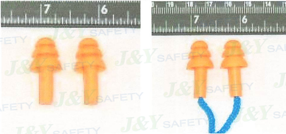
Test Item: Q4949A

These data were obtained through measurements made at the laboratories of Michael & Associates, Inc., State College, PA, USA. Michael & Associates, Inc., is accredited to test to ANSI S3.19-1974, ANSI S12.6-2016, ANSI S12.42-2010, EN352 parts 1-8 and AS/NZ S1270:2002 by the National Institute of Standards and Technology (NIST) National Voluntary Laboratory Accreditation Program (NVLAP).