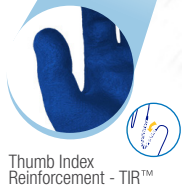
Thumb Index Reinforcement - TIR™