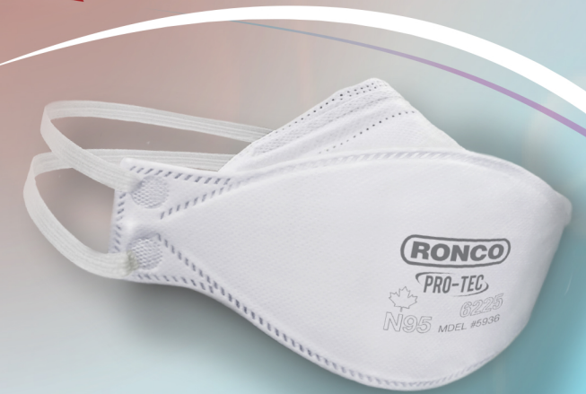
Particulate Filtering Medical N95 Respirator, Flat Folded