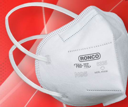
Particulate Filtering Medical N95 Respirator, Vertical Folded