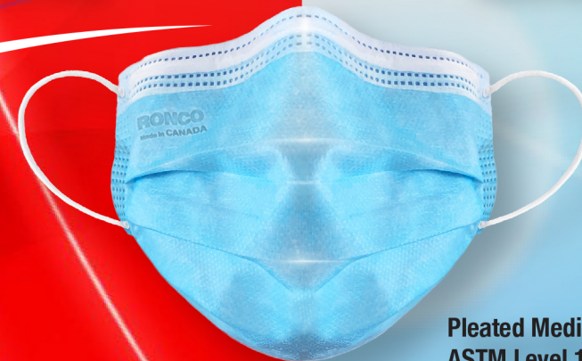
Pleated Medical Masks ASTM Level 1, 2 and 3