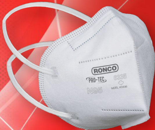
Particulate Filtering Medical N95 Respirator, Vertical Folded