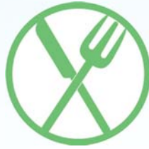
Products that are recommended for use in the Food Industry