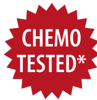
Products tested and safe to use with certain substances used in chemotherapy treatments * Contact RONCO for more details