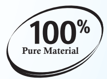
Made from 100% new material