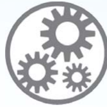
Products that are recommended for use in Industrial Environments