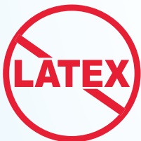
Products that do not contain Latex