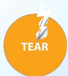
Tear resistant products