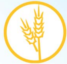
Products that can be used in Agriculture