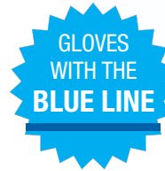
A RONCO Mark of Quality