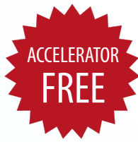
Products manufactured without the use of accelerants (to reduce risks of Type IV allergic reactions)