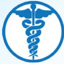
Products that are recommended for use in Healthcare