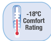
Indicates the temperature at which the products can be used