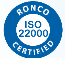
RONCO is ISO 22000 certified for Food Safety Management Systems (FSMS)