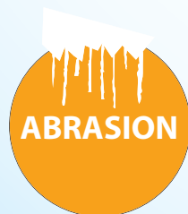
Abrasion resistant products