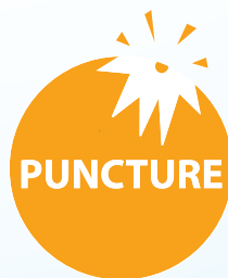
Puncture resistant products