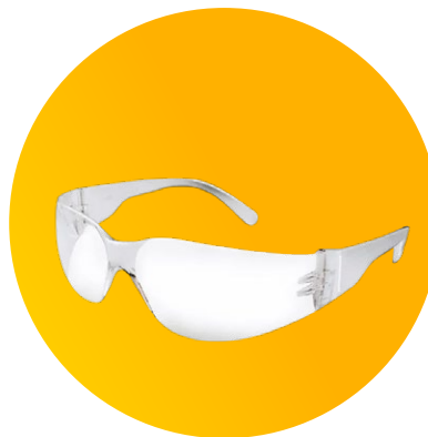
NOVA™ E Series, 82-050

One Piece Lens Safety Glasses, Clear Lens