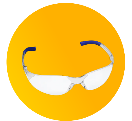
NOVA™ E+ E+ Series, 82-550