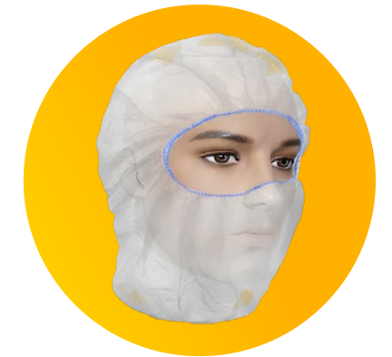
easy breezy™ 189X