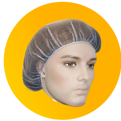
easy breezy™ 1818