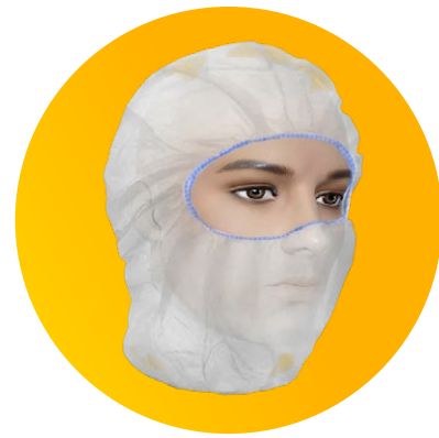
RONCO CARE™ 188X